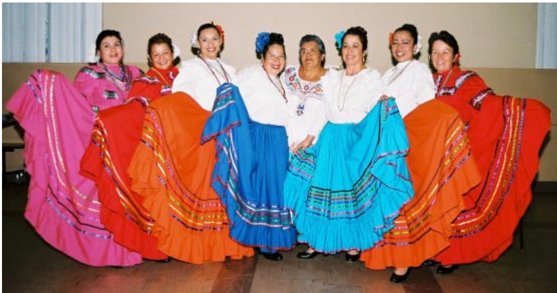
The Presentation Sisters Learning Center Ballet Folklorico will entertain at the LCWR assembly banquet

The dancers are women ranging in age from 25-50 years old, most of whom are recent immigrants from Mexico. In addition to working in difficult factory jobs, taking care of their children and taking English and computer classes at the learning center, they practice dancing several times a week. As costumes are very expensive to buy, the women design and make all their own costumes. Started a year and a half ago, the ballet folklorico is one of the many classes offered at the learning center, an adult school sponsored by the Presentation Sisters in Watts.