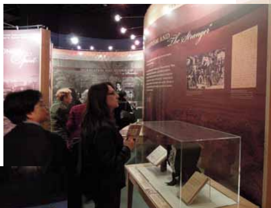
Guests tour the exhibit on opening night