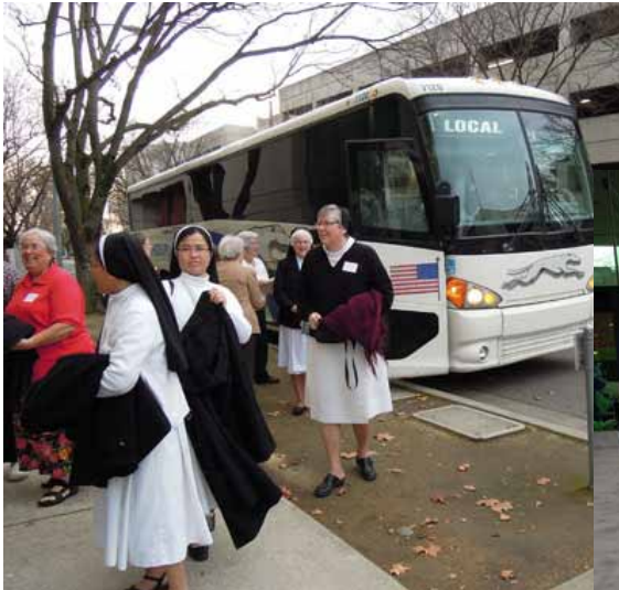
Women religious from throughout the state arrive by bus for the exhibit opening on January 24