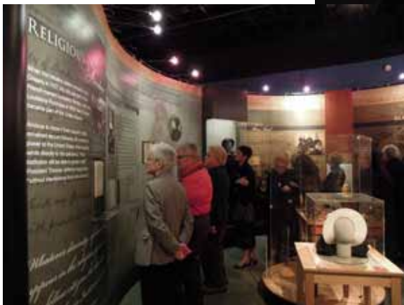
The local committee working with the museum also coordinated a section of the exhibit dedicated to women religious who ministered in California