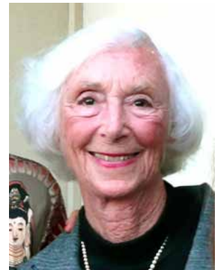
Barbara Marx Hubbard

Barbara describes as a meta-discipline. "The purpose of this metadiscipline," she says, "is to learn how to be responsible for the ethical guidance of our evolution. It is a quest to understand the processes of developmental change, to identify inherent values for the purpose of learning how to cooperate with these processes towards chosen and positive futures, both near-term and long-range." ( Conscious Evolution )