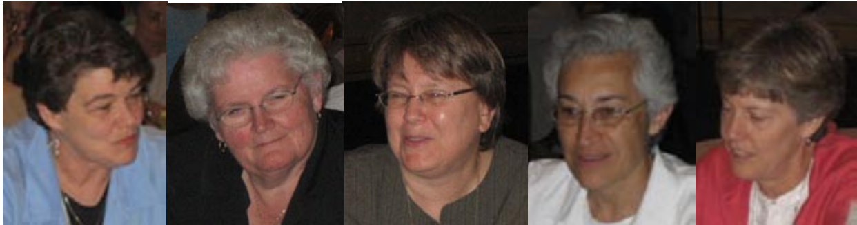
More than 800 LCWR members and associates attended the 2006 LCWR Assembly in Atlanta, Georgia

L CWR closed its jubilee year at the 2006 assembly with a call to step into the future with boldness.