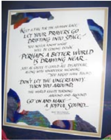
Gift from CMSM to LCWR for its 50th anniversary