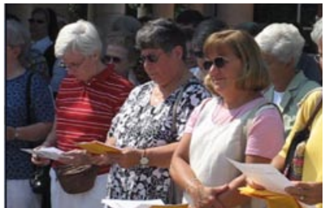
Participants at the pre-assembly interfaith prayer service at the Martin Luther King, Jr. Historic Site.