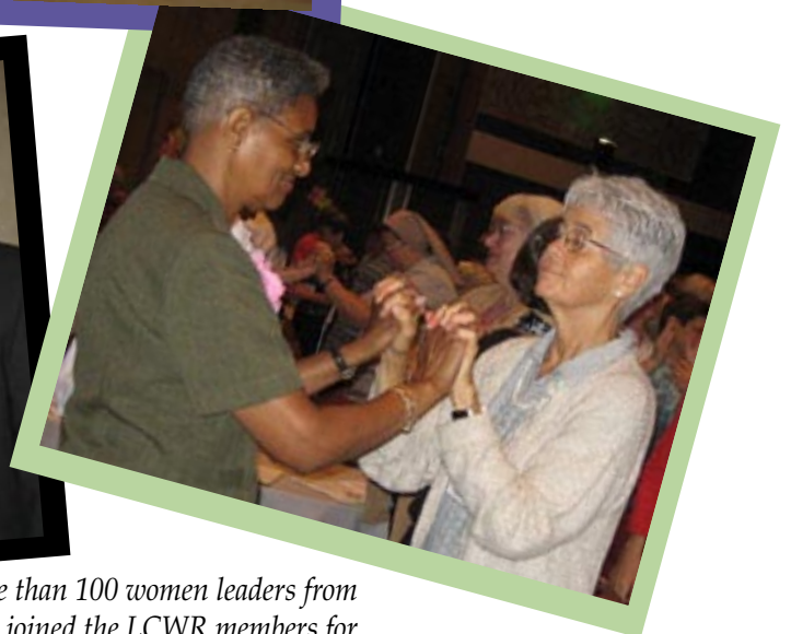
More than 100 women leaders from Atlanta joined the LCWR members for part of the assembly