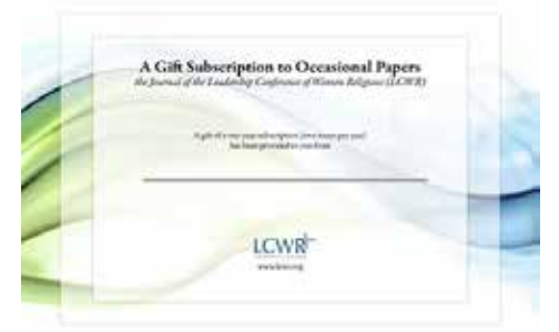
Gift subscriptions are also available. A certificate can be downloaded and given to the gift recipient.

LCWR members are asked to share this information with anyone who may be interested in subscribing. Gift subscriptions may also be purchased. Revenue from these purchases is used to defray the costs of the resources and programs LCWR offers its members.