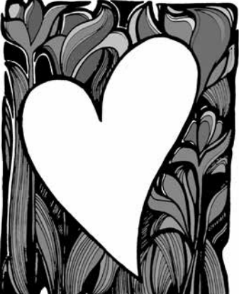
The answer rises immediately from a place so deep and true and grateful: The bearts of my sisters

This is what I know now that I didn't know then.