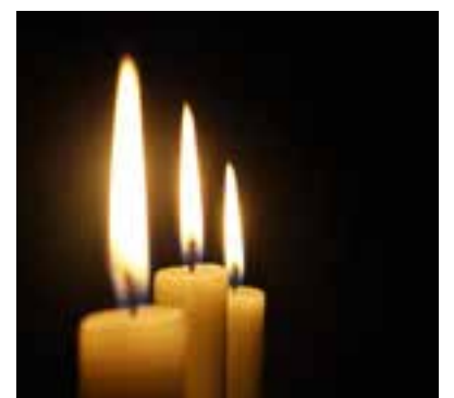
Please remember LCWR's generous donors and their intentions in your prayer.

The 2016-2017 LCWR annual report is available at lcwr.org/publications/2016-2017. All members are encouraged to read the report in order to understand the extent of the service offered by the conference. Members will be asked to approve the report at the August assembly.