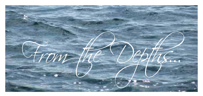
Participants at the 2016 LCWR assembly processed their experience in deepening groups where they had the opportunity to engage in contemplative dialogue. Important insights arose from those dialogues which were collected and shared briefly during the assembly.

Throughout the year, LCWR is sharing some of these insights in various ways so that all members may utilize these thoughts and ideas for their own reflection. Individuals may wish to spend time with the insights personally, and leadership teams may want to consider them communally.