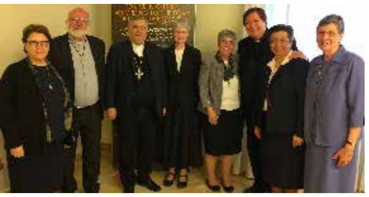
▲ Congregation for Institutes of Consecrated Life and Societies of Apostolic Life

Congregation for the Doctrine of the Faith