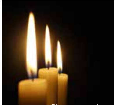
Please remember LCWR's generous donors and their intentions in your prayer.

Examples of projects include development office audits, solar energy projects, studying land and building usage, motherhouse projects, and various eldercare concerns. Information on qualifications for participation is available at: (www.usccb.org/about/national-religious-retire-ment-office/planning-and-implementation-assistance. cfm) or by calling the office at 202-541-3215.