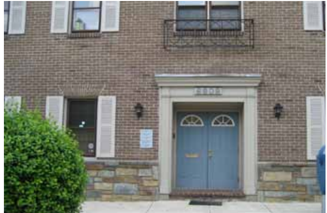
LCWR national office in Silver Spring, Maryland