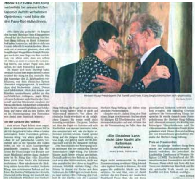
European newspaper coverage of The Herbert Haag Foundation award ceremony, Photo is of Pat Farrell with Hans Küng.