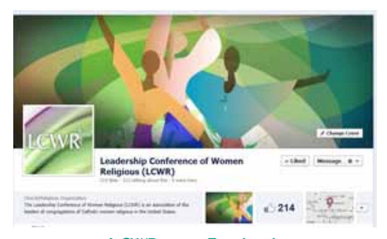
LCWR is on Facebook www.facebook.com/lcwr.org

he board of directors of the Resource Center for Religious Institutes is seeking a qualified person to be executive director beginning January 1, 2014. RCRI is located in Silver Spring, Maryland and is housed in the same building as CMSM and LCWR. More information is available on the RCRI website at www.trcri.org.