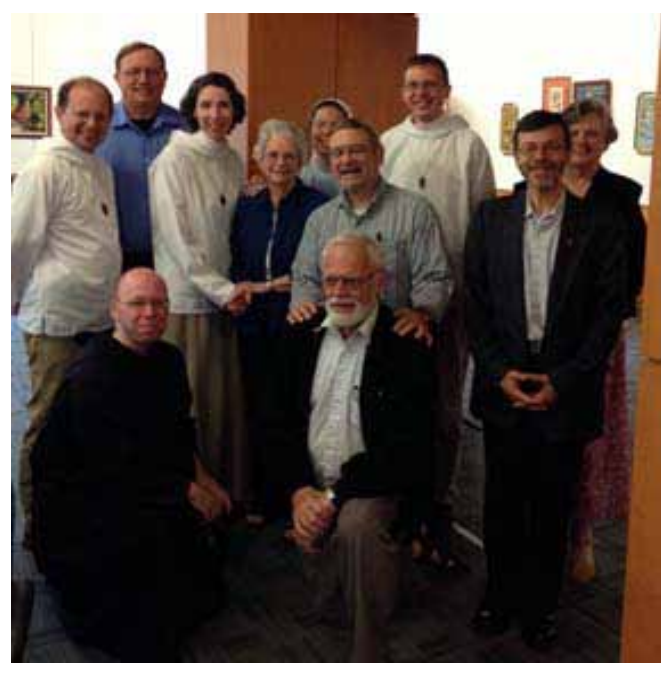
Participants in the 2013 InterAmerican Committee Meeting visit with members of a new community of men and women religious in Canada