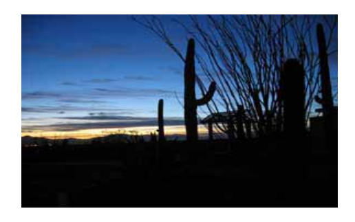
January 19 - 24, 2014 Redemptorist Renewal Center - Tucson, Arizona

Leading from Within: Leading from a New Place is a retreat for LCWR members and LCWR associates who are serving in congregation leadership