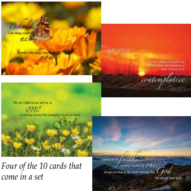
Four of the 10 cards that come in a set

The cards can be purchased at the LCWR assembly for $10.00 a set. Proceeds will go to the LCWR operating budget. Members are encouraged to plan on purchasing multiple packs as gifts.