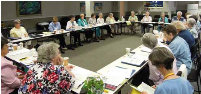
LCWR board at its May meeting

During the board meeting, the members had opportunities to review the hundreds of letters that had flooded the LCWR offices during the weeks prior to the meeting. These messages, coming from the public, and other women and men religious and clergy, expressed opinions about the CDF report as well as hopes for the